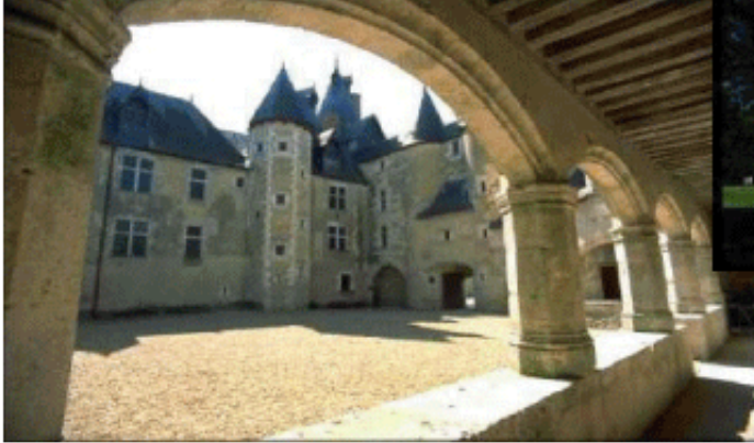
Chateau Fougeres, Loire Valley