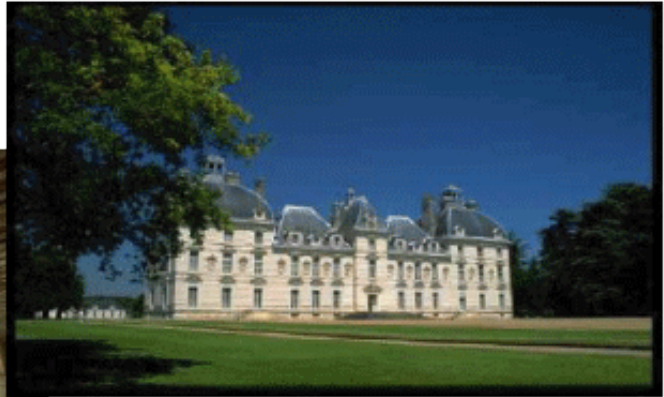
Chateau Cheverny, Loire Valley